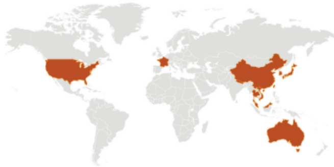
Countries with Confirmed Cases to Date

As the ILA~USMX Joint Safety Committee begins to develop this OSH Alert, we are aware of five (5) confirmed cases of the Coronavirus presently on U.S. soil. We are also aware of the situation on the ground at Wuhan Province, China (inclusive of Wuhan port), wherein thousands of confirmed cases have been established. The situation there is extremely serious.